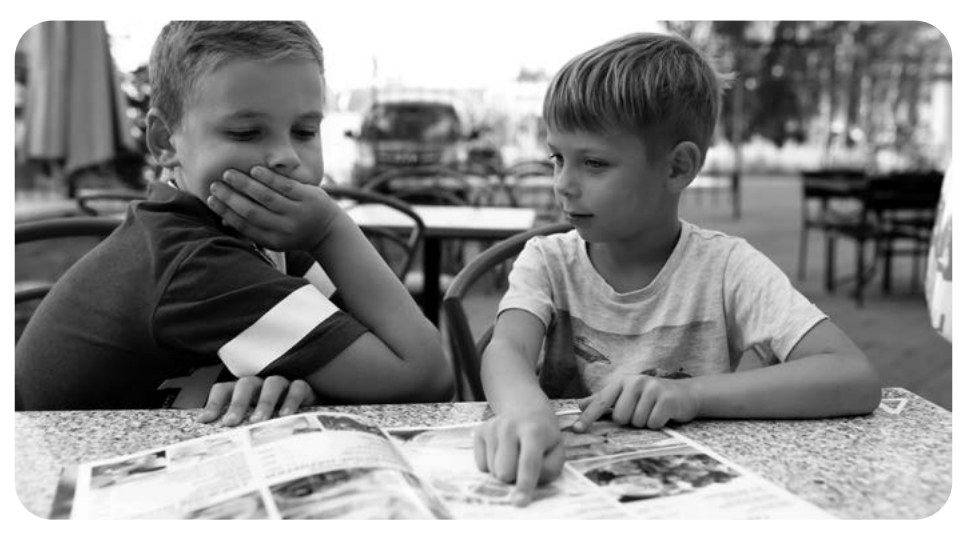
If you have a family law order or child protection order about your children, or if you have proceedings in the family law courts or Childrens Court about your children, you must tell the magistrate, attach a copy of the orders to your domestic violence order application or give a copy to the magistrate.

The magistrate can make a domestic violence order on their own initiative based on the information before the court, or because one of the parties has made a domestic violence order application. The magistrate has to allow the people involved to say what they think about the domestic violence order being made.