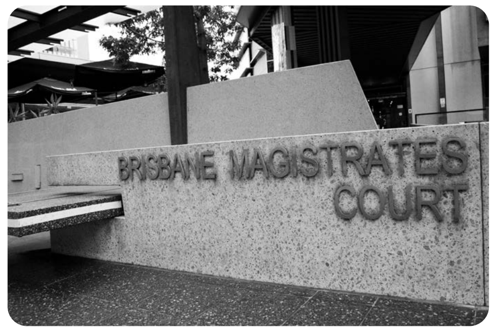
If the respondent is not at court, and the police can show they have served the respondent, the magistrate can make a final domestic violence order.

If the respondent is not at court, and the police can show they have served the respondent, the magistrate can make a final domestic violence order. The magistrate must be satisfied any conditions included in your domestic violence order are supported by enough evidence.