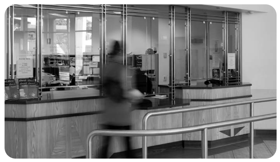
You should get legal advice if you want to file an appeal.

If you disagree with the magistrate's decision, you can appeal it. You need to file the appeal in the District Court within 28 days from the date the magistrate made the decision about the domestic violence order.