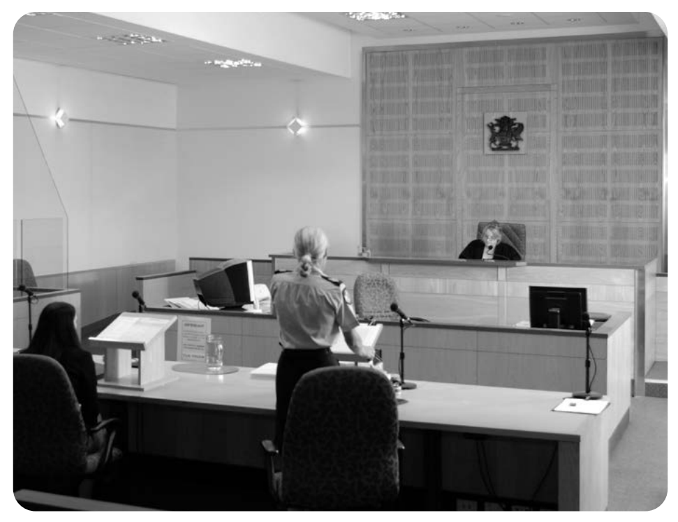
At the hearing, you may be represented by a police prosecutor, Legal Aid Queensland lawyer, private lawyer or yourself.