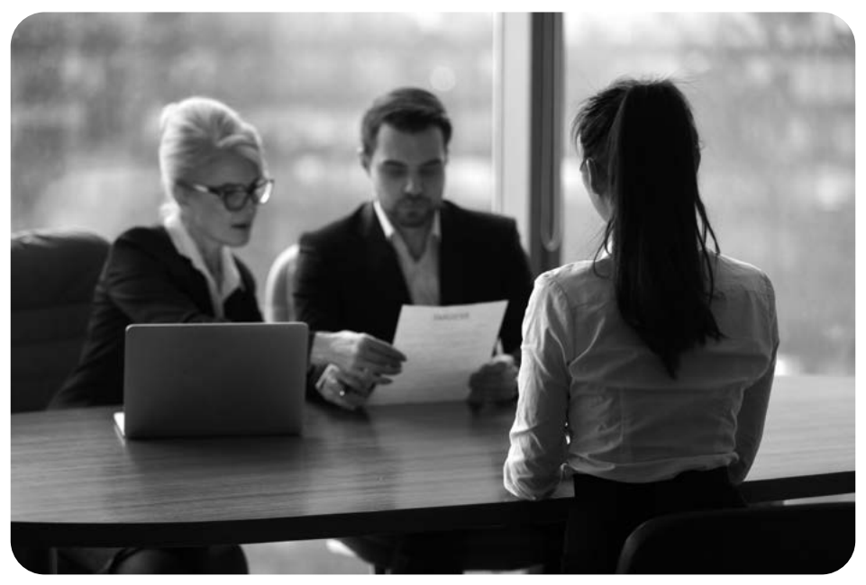
If you do separate from your partner and they are sponsoring your visa, you should get urgent legal advice.

If you are concerned about a domestic violence order that was made before this date being enforced, call Legal Aid Queensland on 1300 65 11 88 for advice.