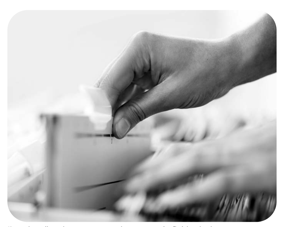
Know where all your important papers are in case you need to find them in a hurry.